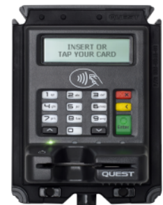
UT430 Unattended Payment Terminal

Cloud EFTPOS Wedge manages the PINpad local connection, as well as the upstream connection to the Cloud.