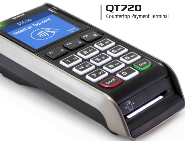
QT720 Countertop Payment Terminal

For traditional retail situations using USB or RS232 connected PINpads, Cloud EFTPOS provides a convenient lightweight cross-platform EFT client offering a simple POS interface.